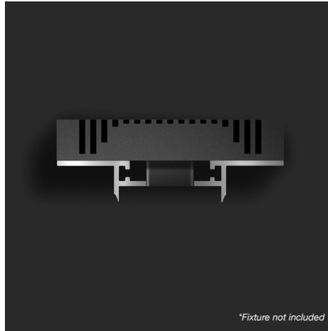
*Fixture not included