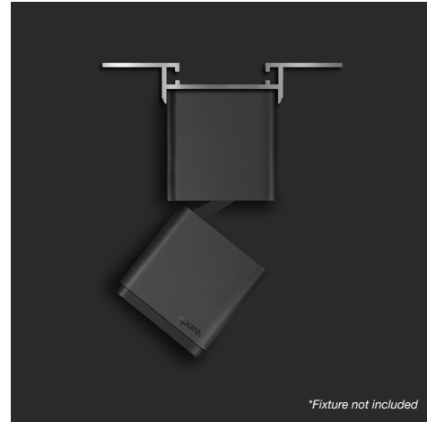
*Fixture not included